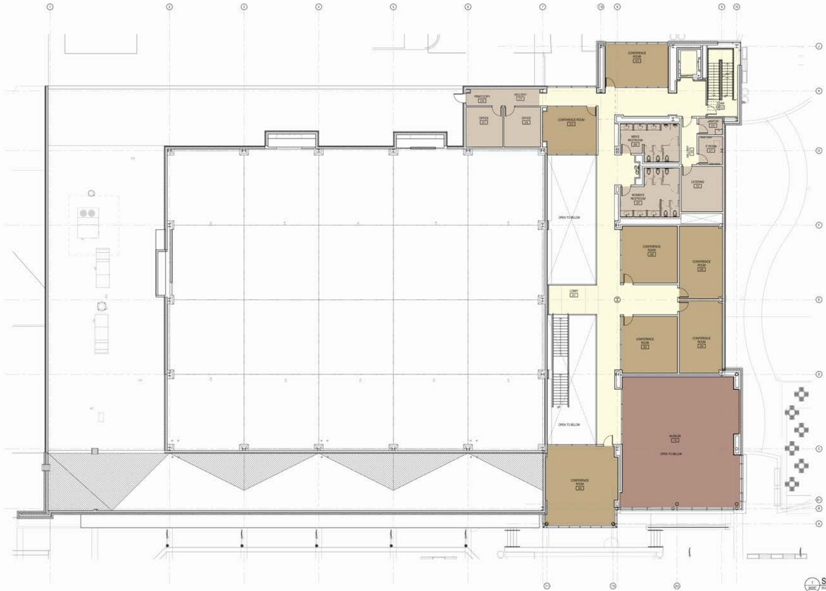
1 SECOND FLOOR PLAN 2000 SCALE 1/8"=1'-0"