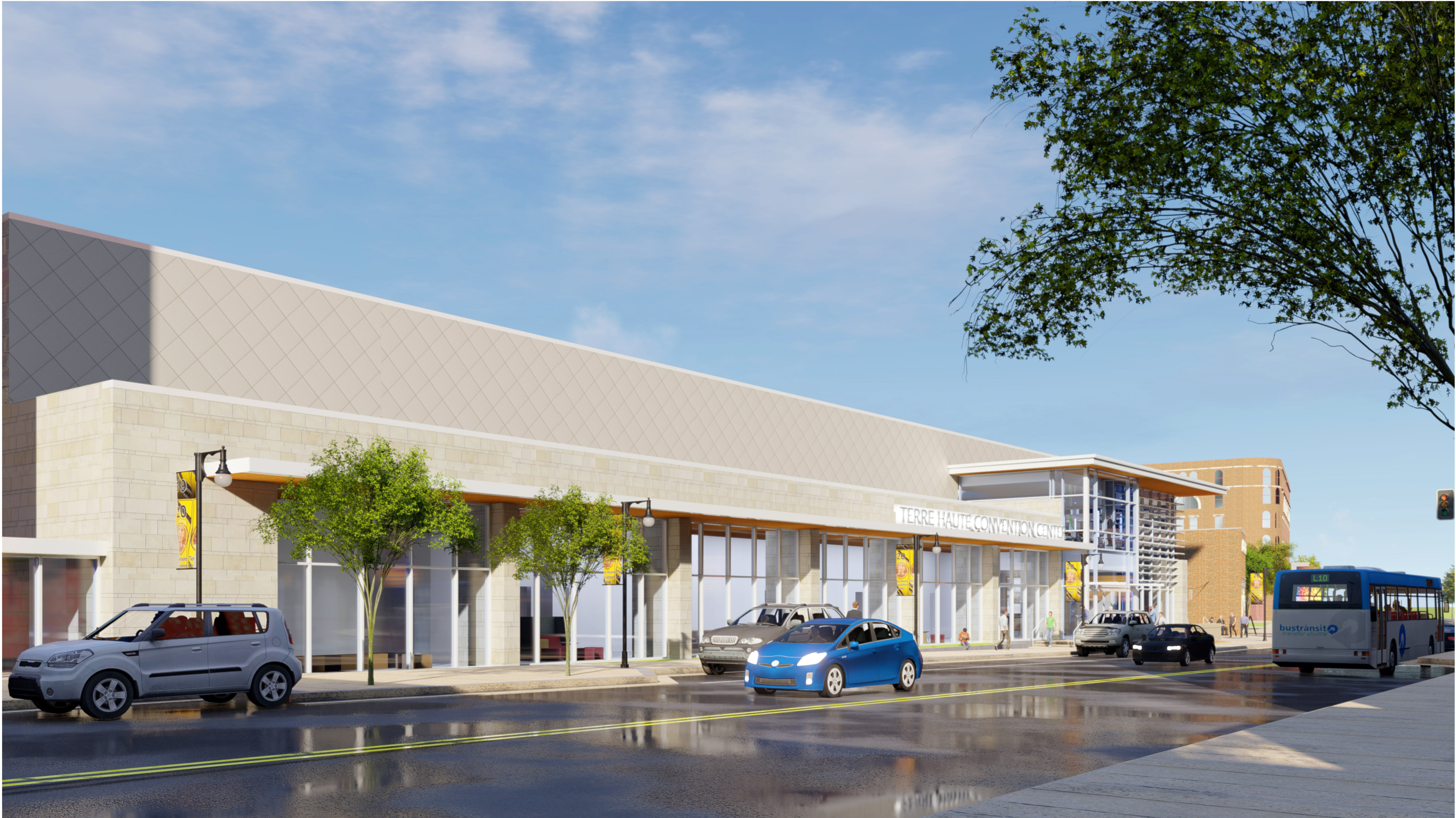
Convention Center East View