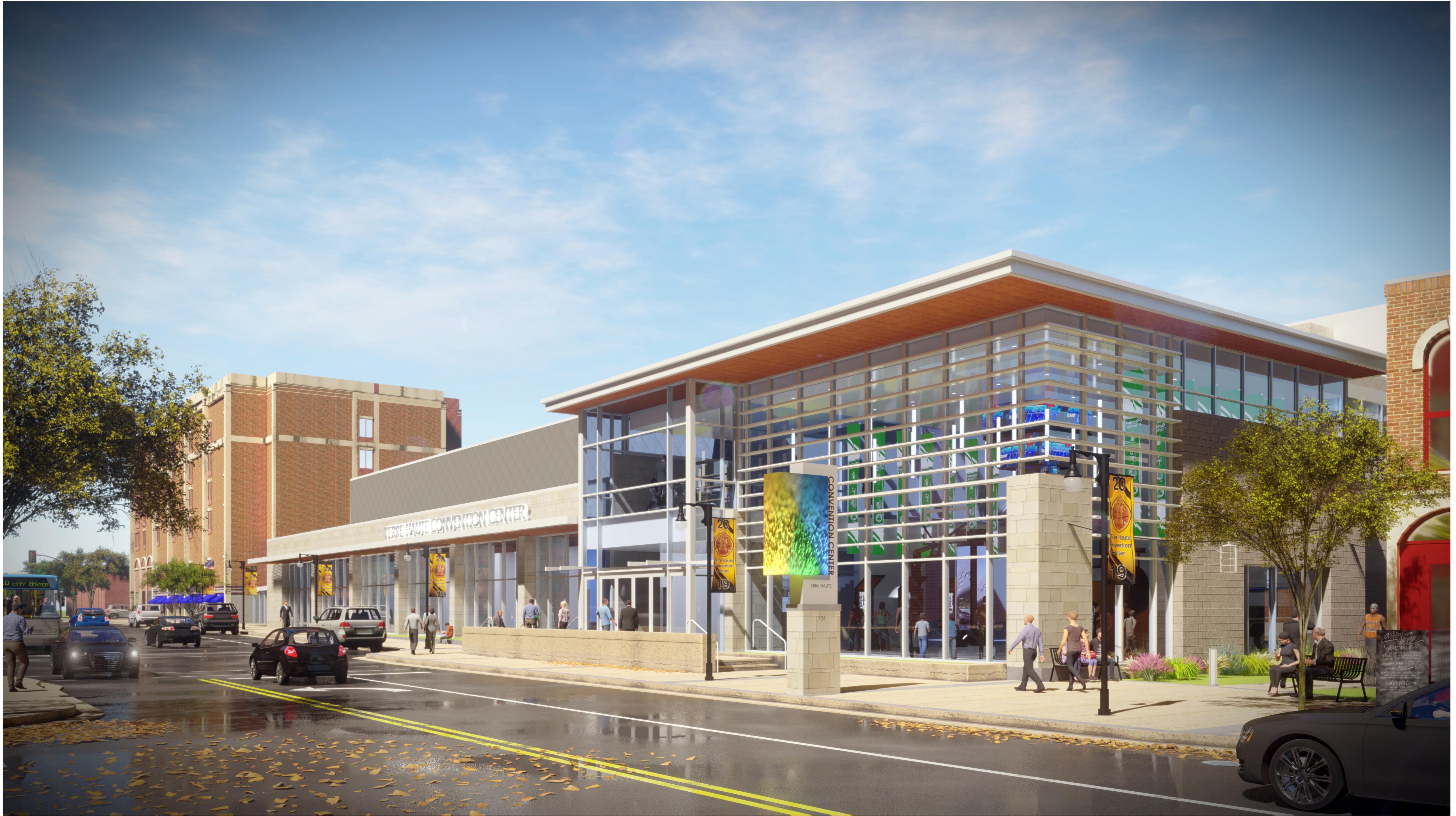
Convention Center West View